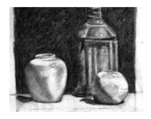
STILL LIFE DRAWING WITH CHARCOAL WORKSHOP