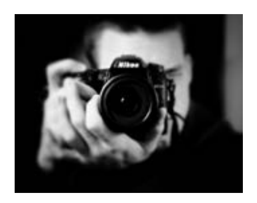
BEGINNING DIGITAL PHOTOGRAPHY WORKSHOP