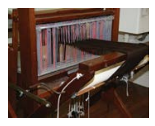
WEAVING: THE BASICS & BEYOND