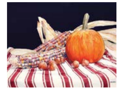
WATERCOLOR WORKSHOP: FALL STILL LIFE PAINTING