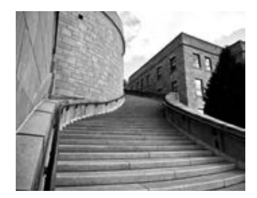
PERSPECTIVE WORKSHOP FOR THE VISUAL ARTIST